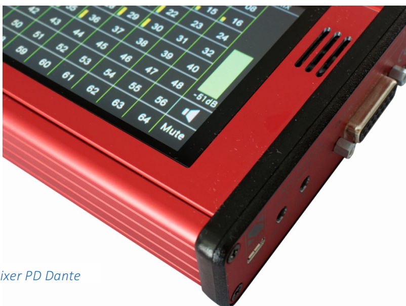
Nixer PD Dante

The speakers and headphones have independent settings for volume, the unit recalling the last used setting for each when changing between speakers and headphones.